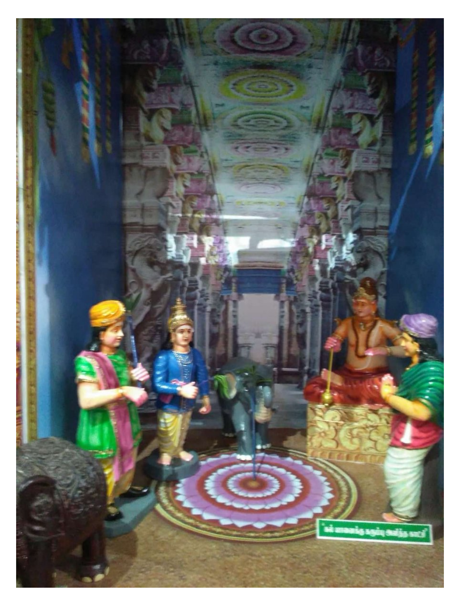
And told Siddhar that if he had such power then make one of stone elephants supporting the Indra Vimana to eat these Sugar cane. Siddhar smiled and replied, "You want to test my power then." Siddhar made a gesture with his eyes to one of