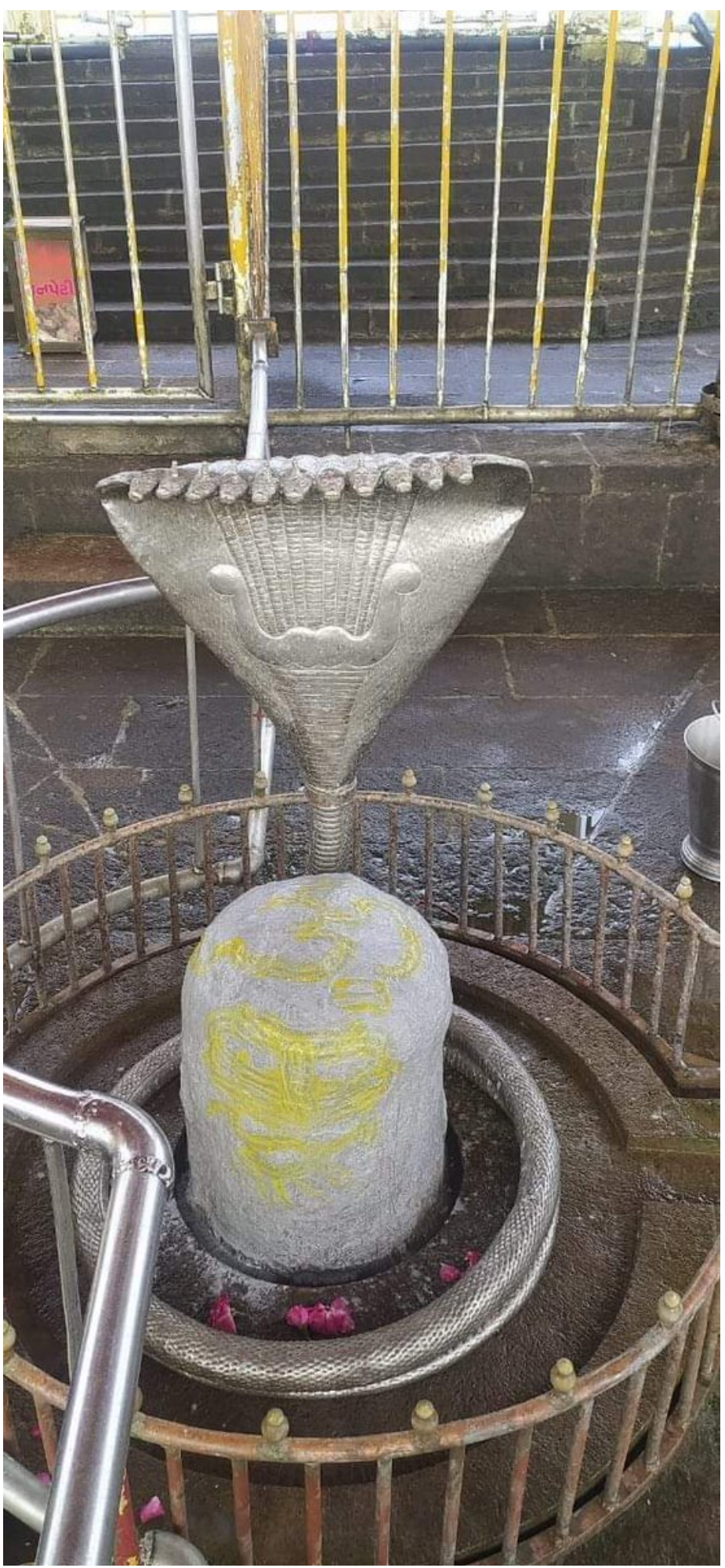
The Temple is also known as the Submerging temple. The Temple is flanked by the Arabian Sea on one side and the Bay of Cambay on the other side.