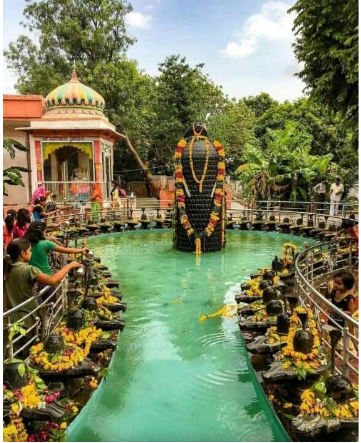
Between the Shivalingas, there is a huge statue of God Pashupati Nath. The speciality of this temple is that the 525 Shivalingas are placed in the Swastika Formation. The bird eye view gives the perfect picture of Swastika. There is also a 14 Ton and 11 ft long Sahastra Shivalinga.