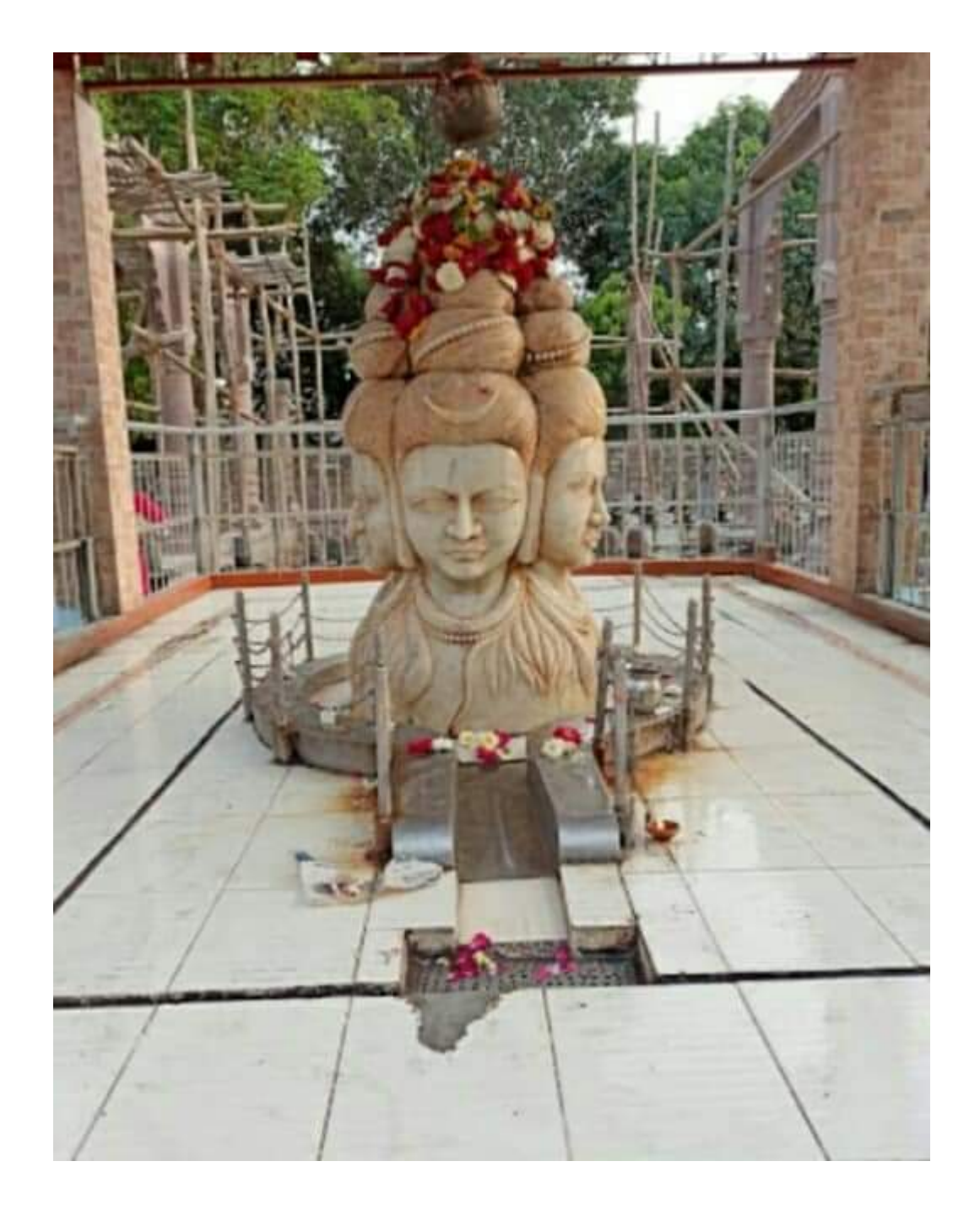
Shivpuri Dham is famous countrywide for its 525 Shivalingas. Every year lakhs of devotees visit this shrine and pilgrimage. If you go to Rajasthan, the Shivpuri Dham of Kota is a must visit.