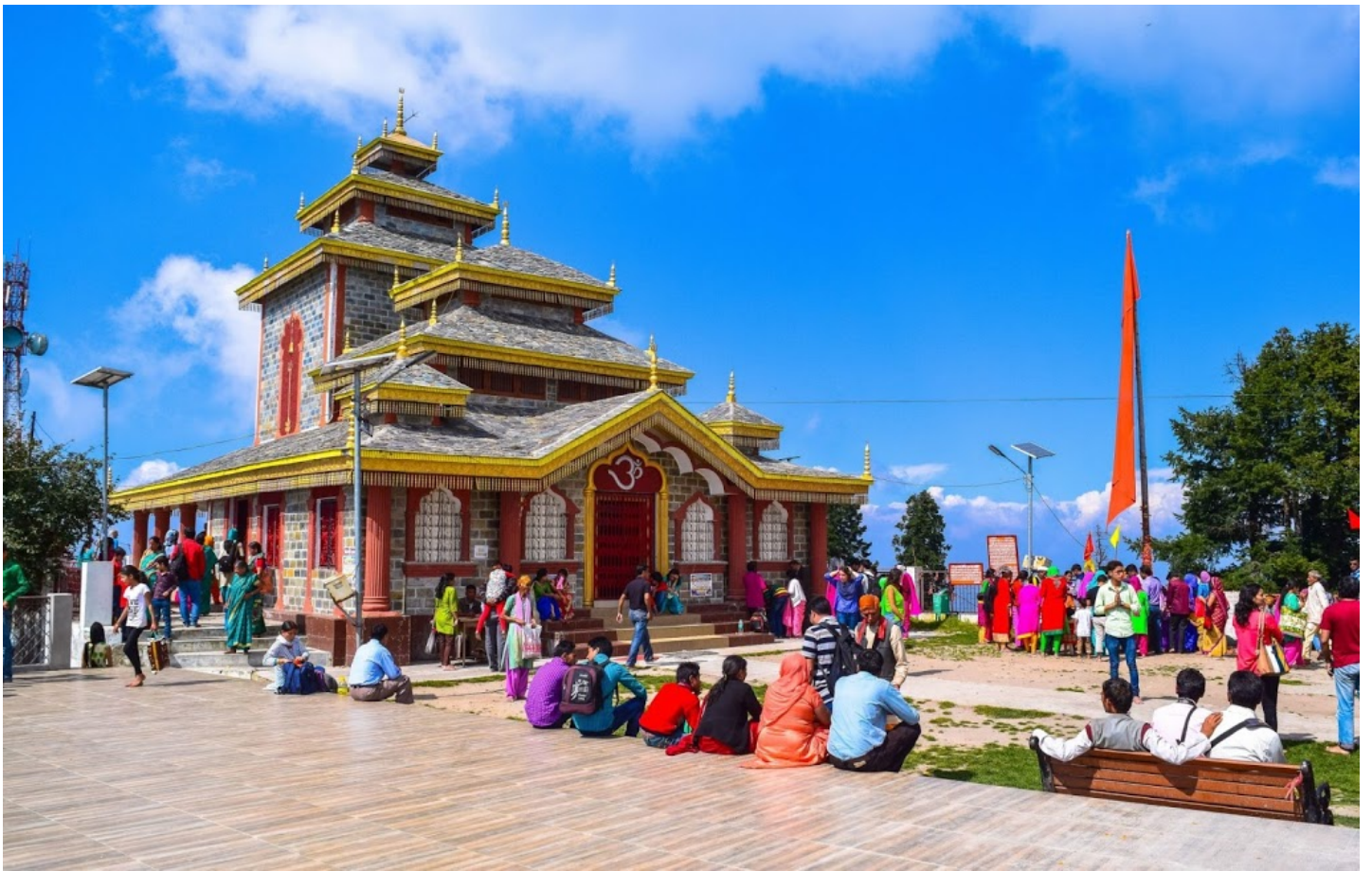
The origins of the Surkanda Mata Mandir is attributed to Goddess Sati, consort of Bhagwan Shiv who in a rage immolated herself in her arrogant Father Daksha's Yajna Kund bcoz he didn't invite Bhagwan Shiv in the Yajna.