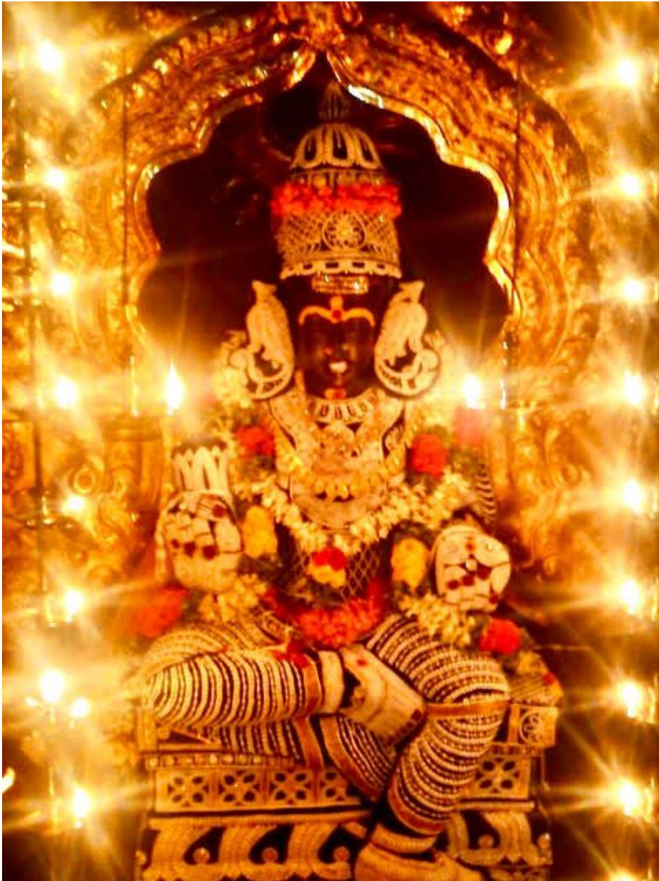
Shiva blessed Devi to be Shanta nayagi. There is a sculpture here depicting Shiva pacifying Devi. If you observe closely, you can see that from your left hand side there will be a smile on Her face and if you see from your right hand side you can see anger in Her face.