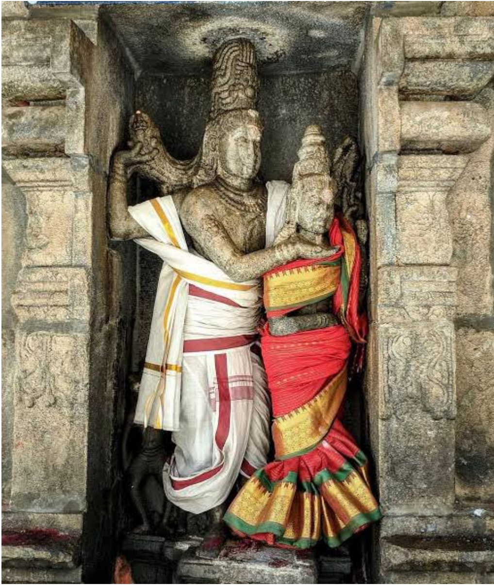
Hayagriva taught the greatness of Lalitha Sahasranama to Rishi Agasthya. Pleased with his devotion, Ma Lalithambikai appeared before Agastya. He is believed to have then sung Lalita Navaratnamala in praise of Devi. He has also composed a hymn named Rahasyanamasahasram.