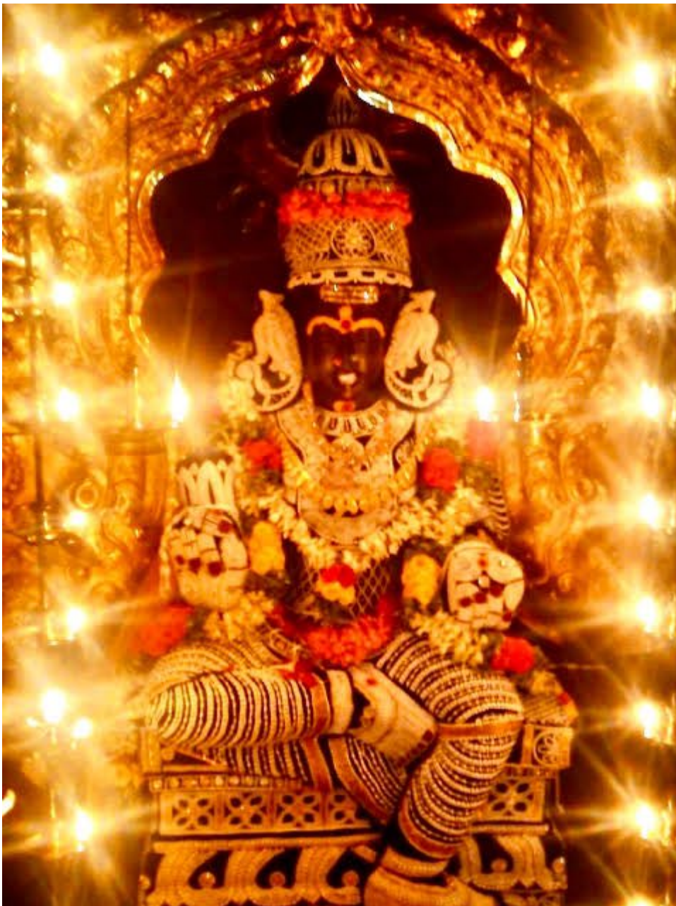
Shiva blessed Devi to be Shanta nayagi. There is a sculpture here depicting Shiva pacifying Devi. If you observe closely, you can see that from your left hand side there will be a smile on Her face and if you see from your right hand side you can see anger in Her face.