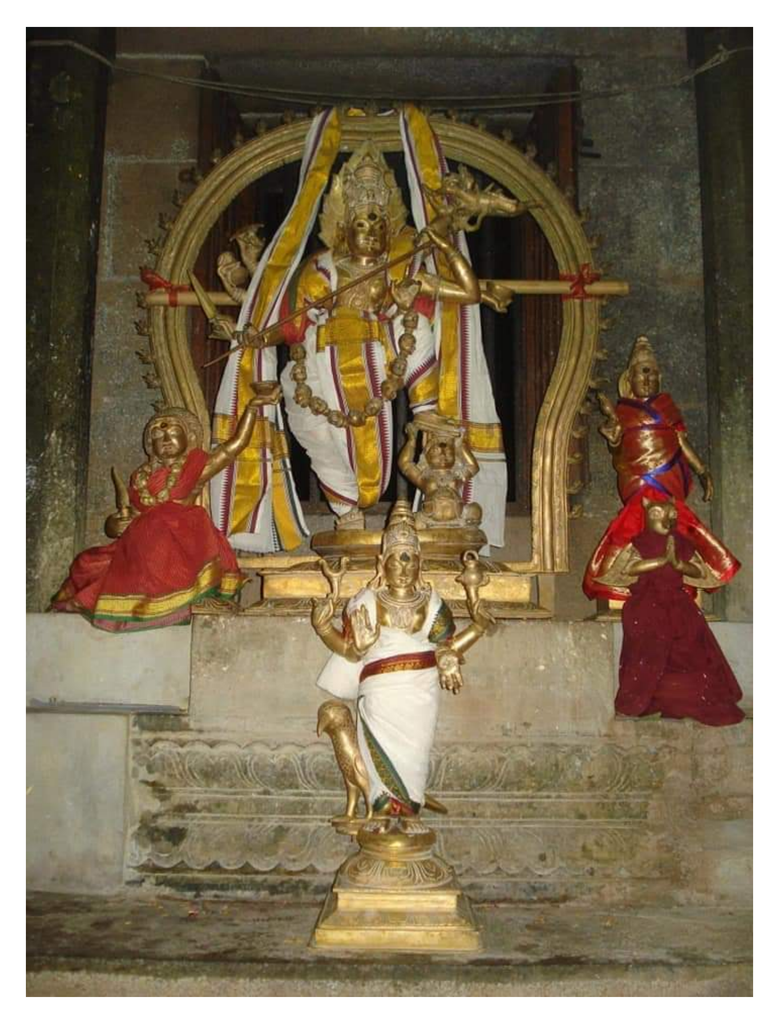
Shiva Alayam at Thirukkovilur, Tamilnadu is dedicated to this great victory of Shiva over <a href="https://t.co/1ht5O8FYzC">https://t.co/1ht5O8FYzC</a> is one of the Ashta Veeratta <a href="https://t.co/w03WGf6dpt">https://t.co/w03WGf6dpt</a> is significant to note that the uniqueness of this place as Andakasura was