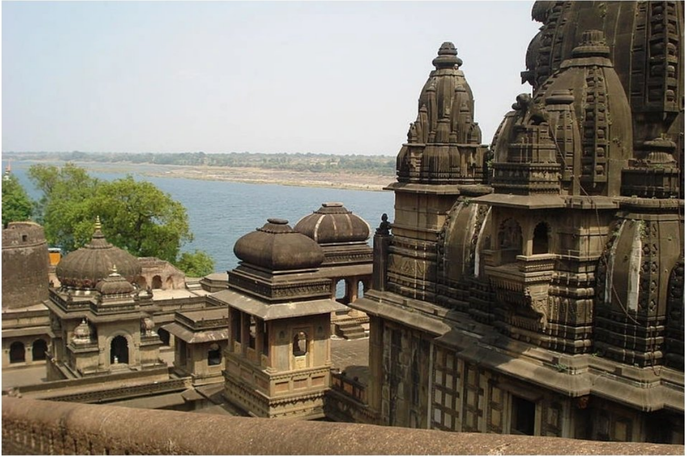
Ahilya Bai's Temple.

Maheshwar was a flourishing literary, musical, artistic and industrial capital of Ahilyabai. She established a textile industry in the city of Maheshwar. Ahilyabai's legacy of good deeds, her dedication to religion and her policies enriched the cities of Maheshwar and Indore.