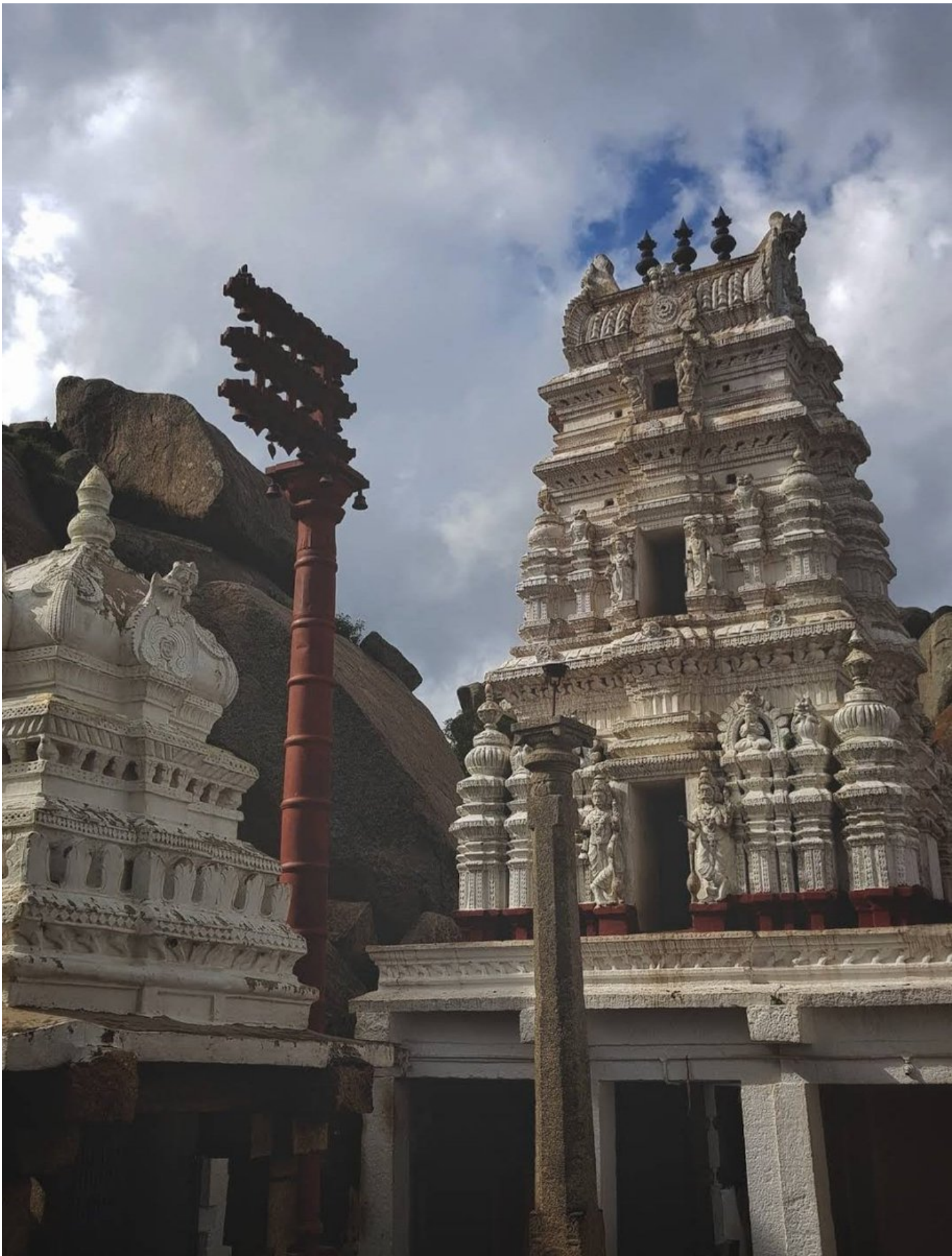
Narasimhar appeared with Lakshmi Devi here to give darshan to Bhrama Deva here.

■■■■■ ■■■■ ■■■■■■■■■■ ■■■■■■■■ ■■■■■■■■■■