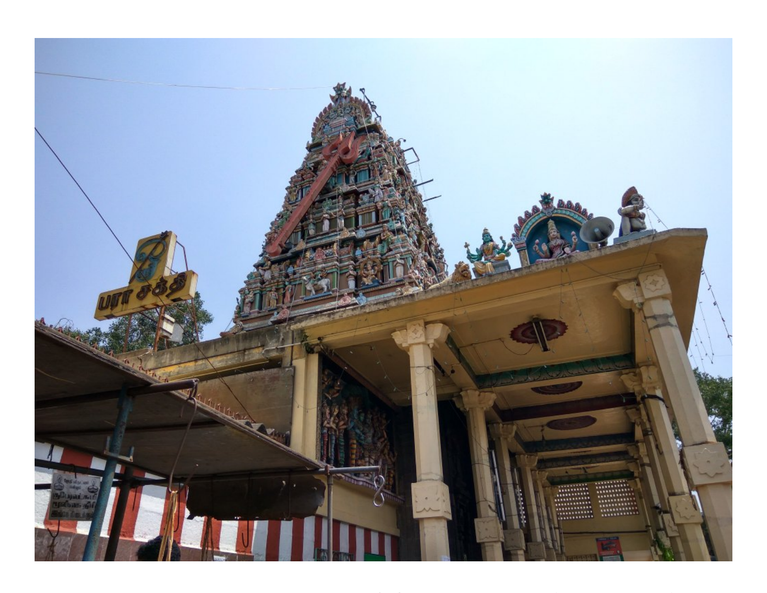
Aadi festival in July- August is a major festival of the temple. On Sundays, Ksheerabhisheka (abishekam with milk) is performed with 108 pots of milk. In the evening, the deity is taken out in a procession. 11/n