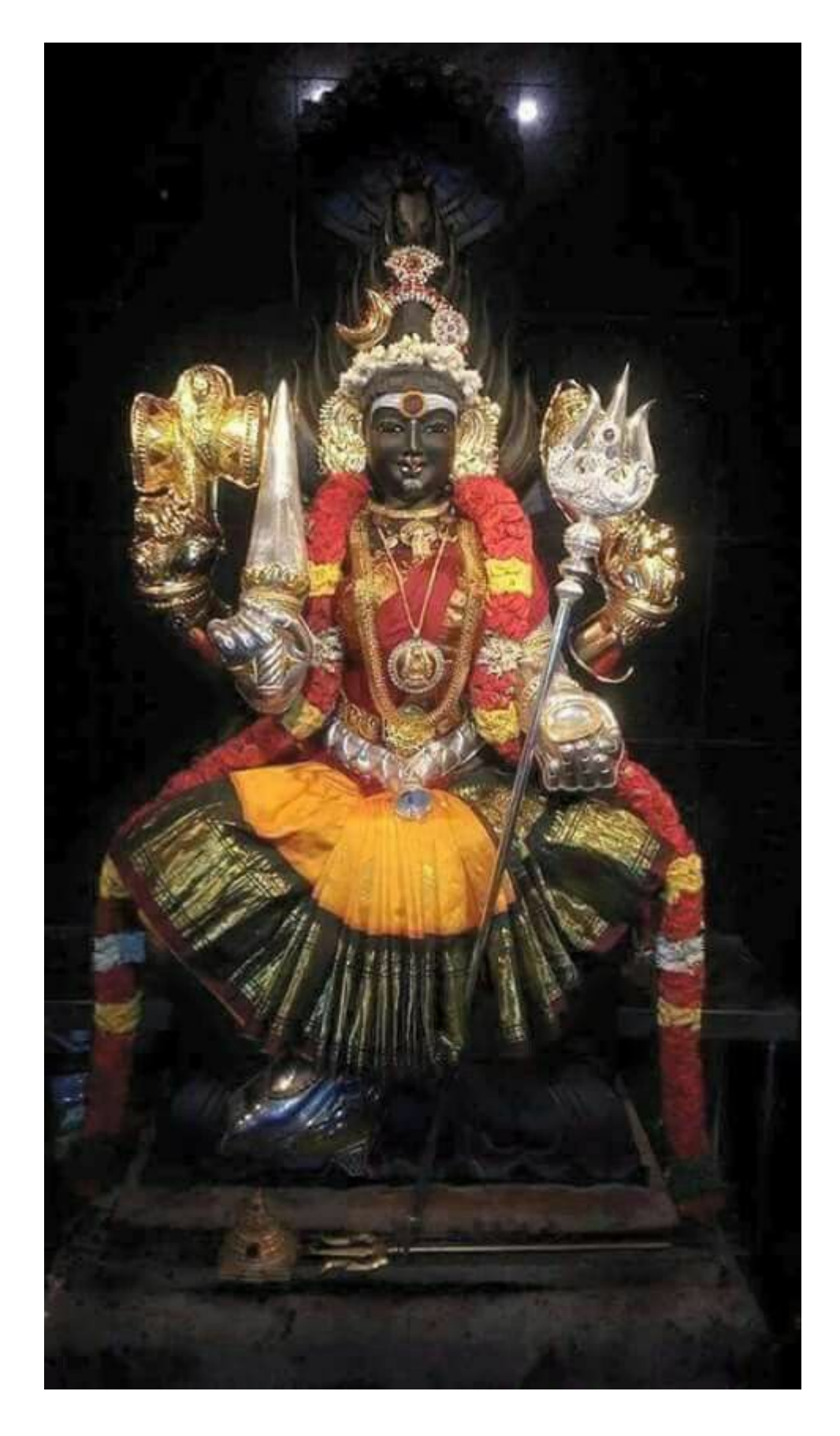
Origin of this mandir is said to around 1000 years old. At the entrance of the temple, is a sannithi for Bhagwan Ganesha, under a tree, on the left of the flag post. As we enter the mandir, we can see the Navagraha sannithi to the left &.. 6/n