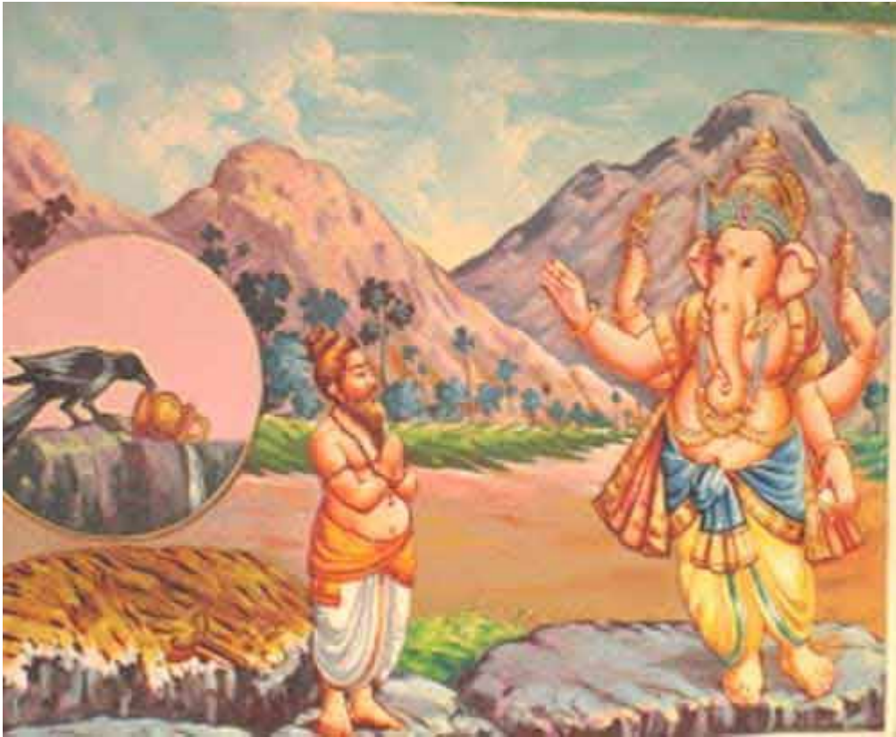
Tala Kaveri has temple for Agastheeswara, which denotes the story between Kaveri and Agasthya muni. Kaveri is a part of Ganga, thus, also called Dakshina Ganga.