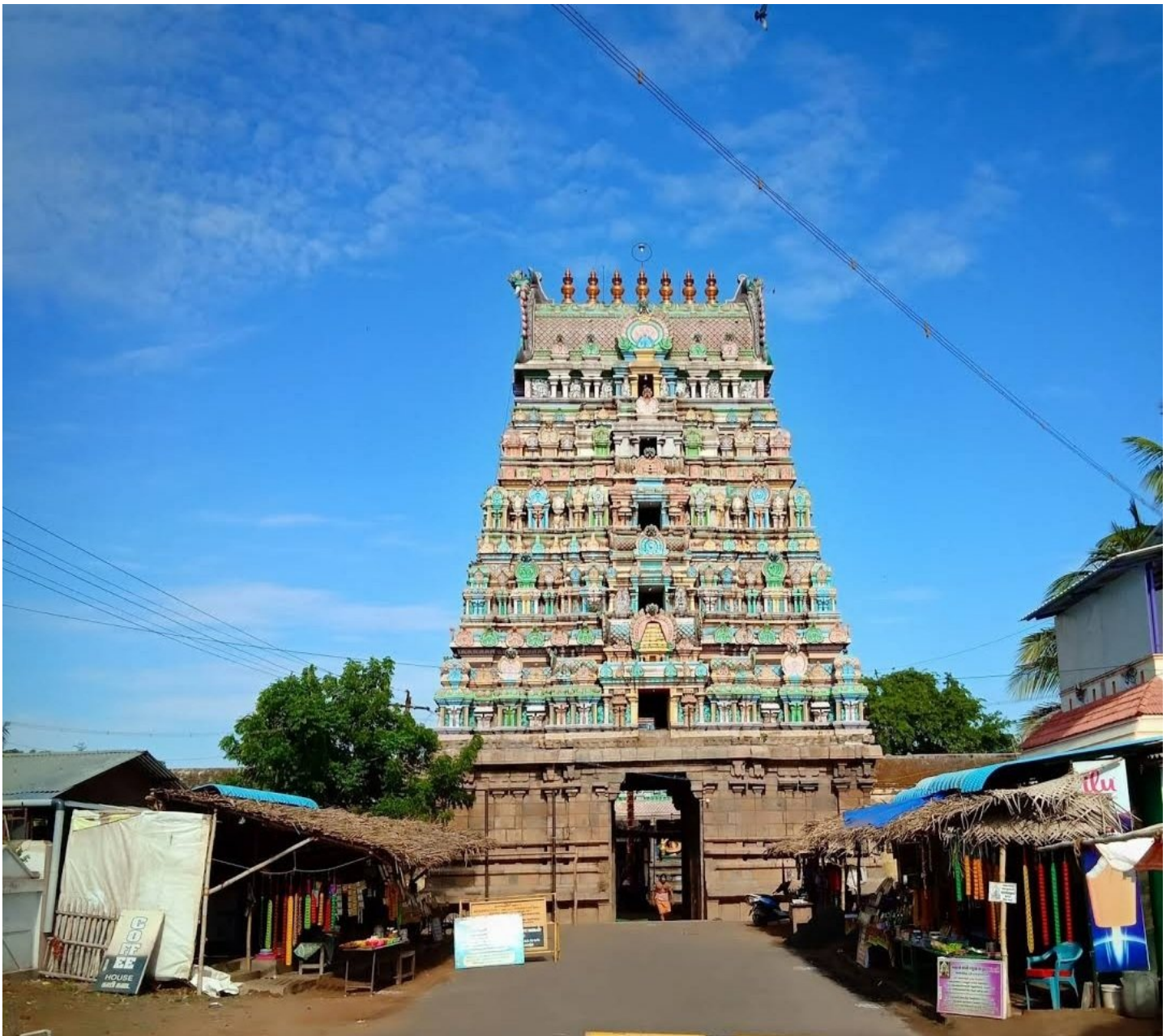
Mahadeva and Surya Deva was cursed for not allowing Aruna to worship Mahadeva. Surya Deva's curse was relieved after worshipping here. Hayagriva, taught Lalitha Sahasranamam to Agasthya Muni and Agasthiyar chanted Lalitha Sahasranamam before Devi here.