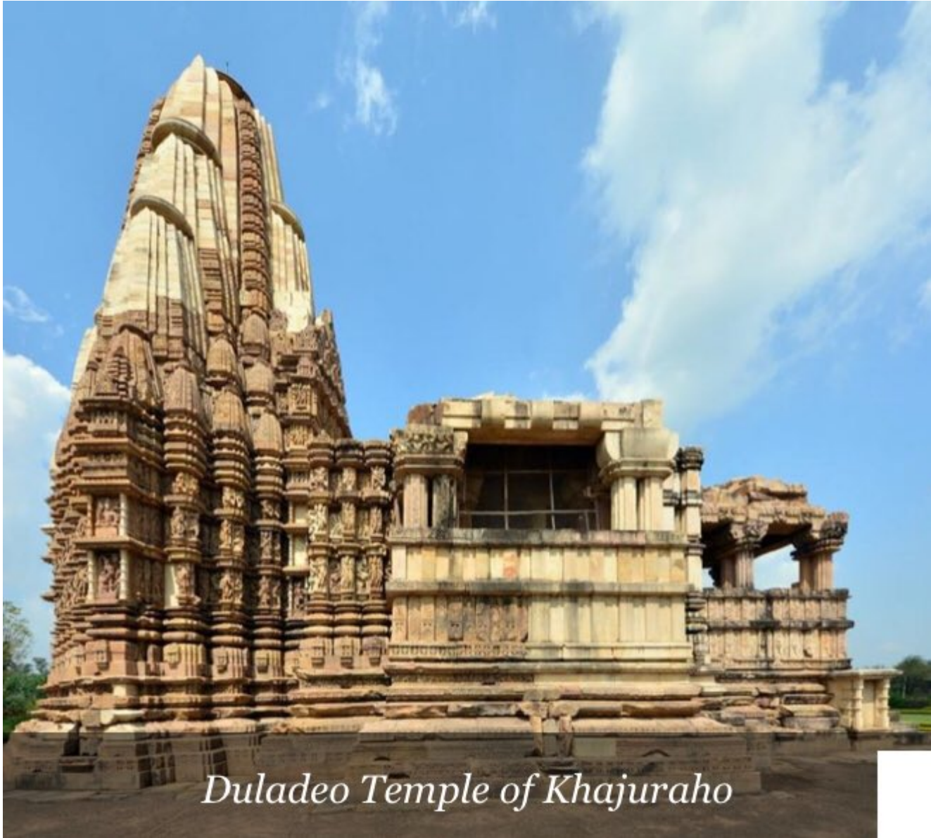
Duladeo Temple of Khajuraho

In the tantric tradition, the Sixty-Four Yoginis are the presiding deities that guide and govern the entire fabric of life.