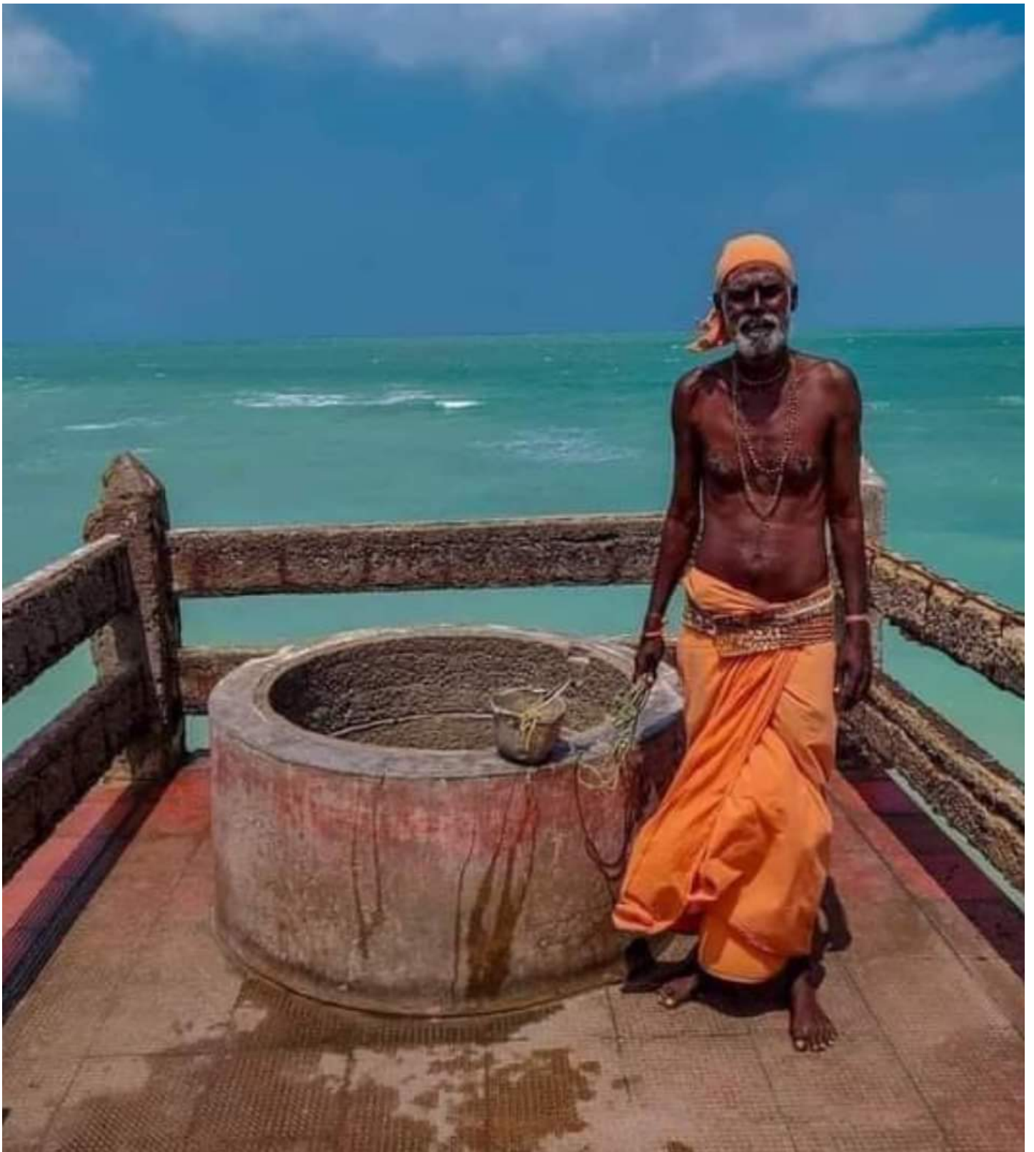
A beautiful beach of #TamilNadu and one of the 64 teerthas(sacred water bodies) of Hindus in #Rameshwaram .There is a small Shiva shrine nearby and the Shiva linga here is named Thrayambakeshwara. The reason for this fresh water body in the sea is stated in #Ramayana.