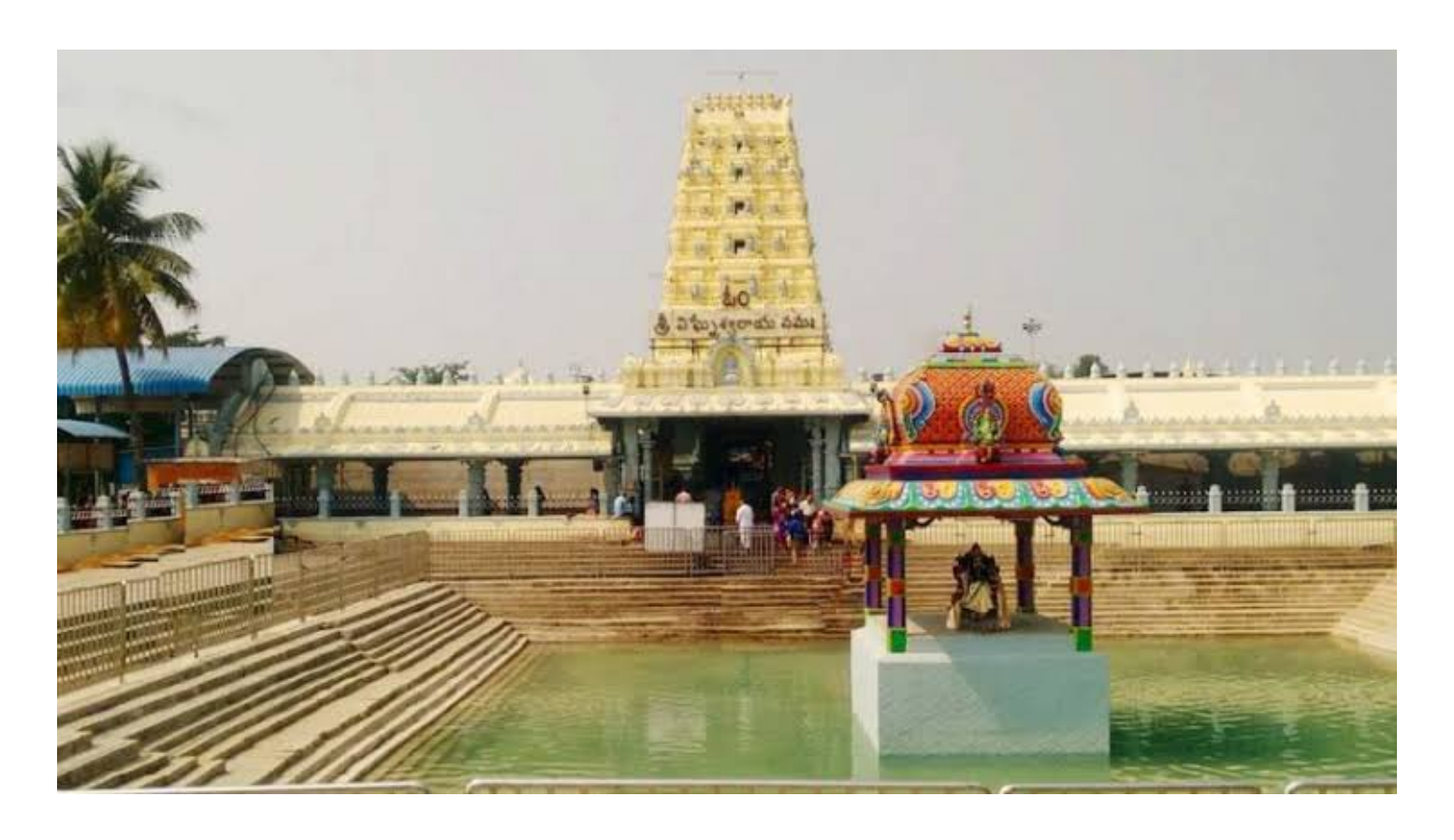
His tool hit something and blood oozed out. They found a swayambhu murti of Ganesha here. Villagers started offering coconut water which overflew into a channel. Hence the name Kanipakam.