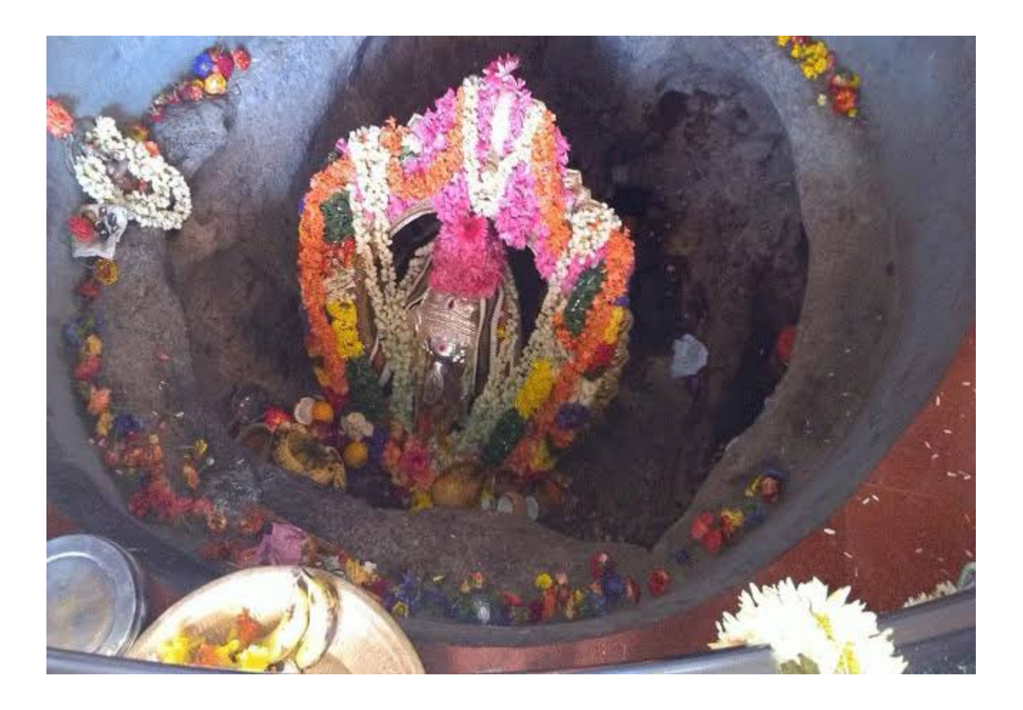
The murti is still growing in size. At present, we see the knees and the abdomen only. The Kavacham (Armour) offered to Vinayaka 50 years ago doesn't fit today.