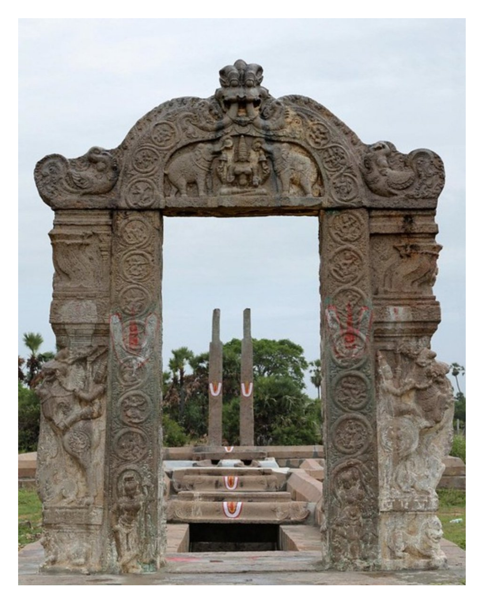
Ayyangar Kulam Nadavavi utsavam is a unique festival celebrated on full-moon day in month of Chithirai when Varadaraja Perumal of Kanchipuram visits Nadavavi well. Devotees carry Varadaraja Perumal inside cool premise of the mandapa in hot month of Chithirai &worship is offered.