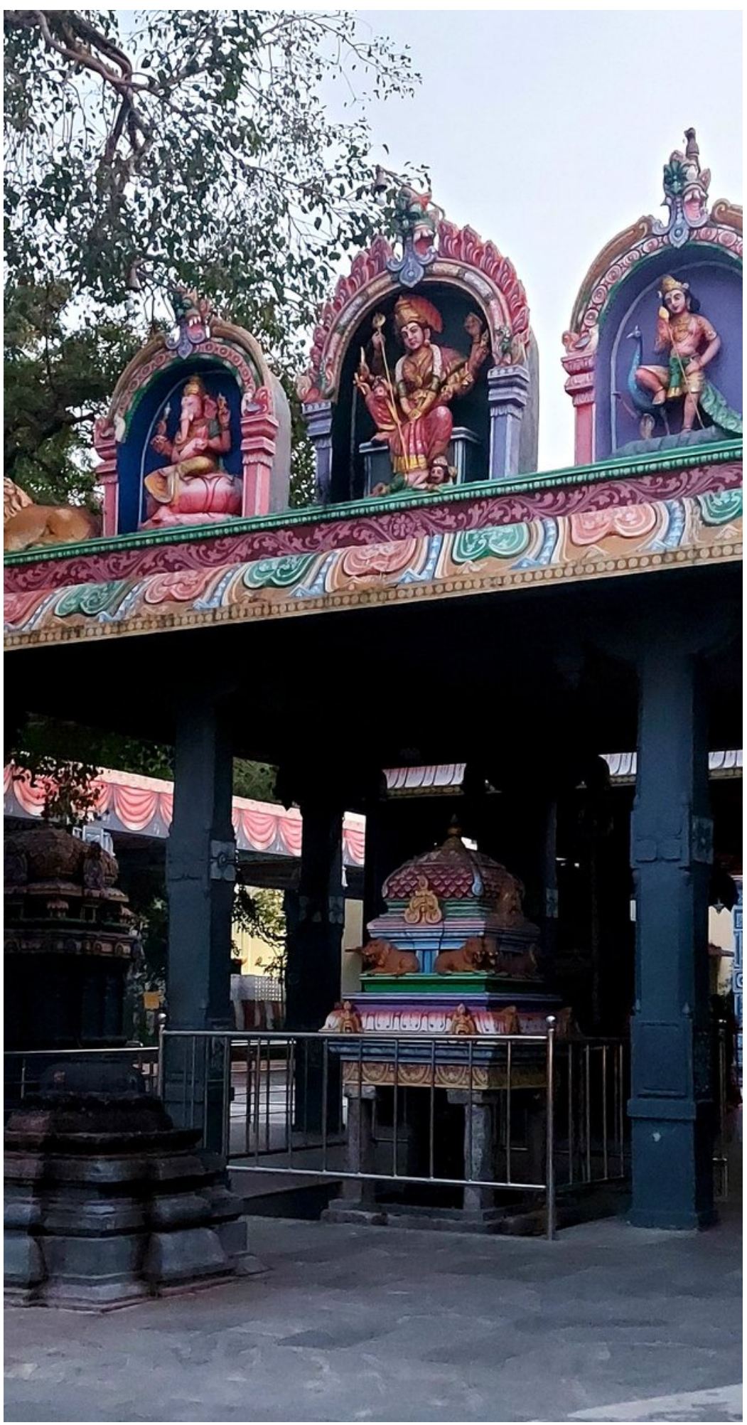
Kapalishwarar in full prep mode for the upcoming Panguni Festival that begins with Kodi Yetram (flag hoisting) tomorrow.