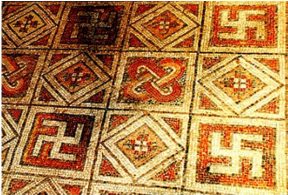
Ancient Roman mosaics of La Olmeda, Spain ca 300–390 CE.

Such ubiquitous occurrence of only one symbol throughout the ancient world from Europe, North, Central & South Americas to China & Japan presents a compelling proposition; that of migration of people out of Bharat.