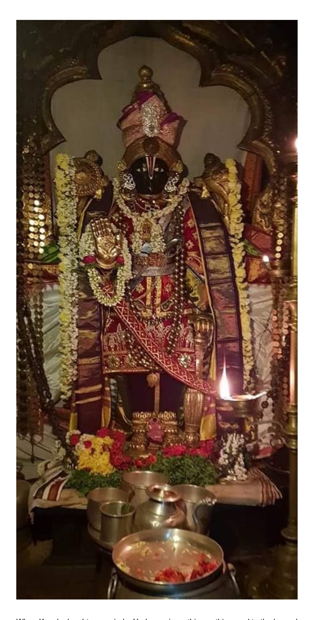
When Kusa's daughter married a Yadava prince, this murthi moved to the lunar dynasty from solar.