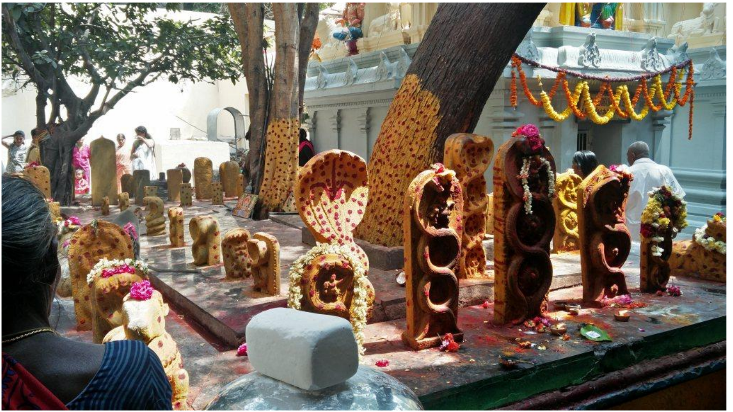
Temple is built according to Dravidian style of architecture. There is a pillared veranda in front of kapileswara swami temple. These pillars were built in early Vijayanagar period, this temple stands at the entrance to a mountain cave in one steep