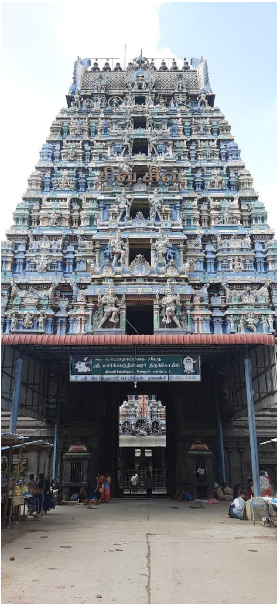
2. #Sattology about this Temple: A 110 high, 7 stage, east facing RajaGopuram is the one that welcomes us first. Sri Adi Shankaracharya had done Beejakshara Pradhishtha to Simha theertham. This temple is also known as 'Baskara