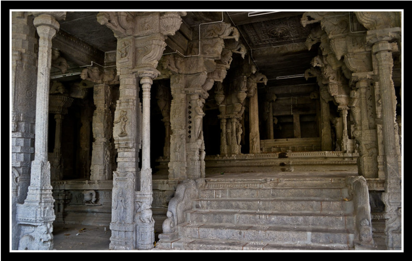
5. Advaita Sidhantha after Adhi Sankara. His Margabandhu stotram on this Margabandheeswarar is for the protection of people while on journey. By reciting this one can have Mahadev with them as Marga-bandhu (protector during journey) along their journey. @Vaidyvoice @desi_thug1