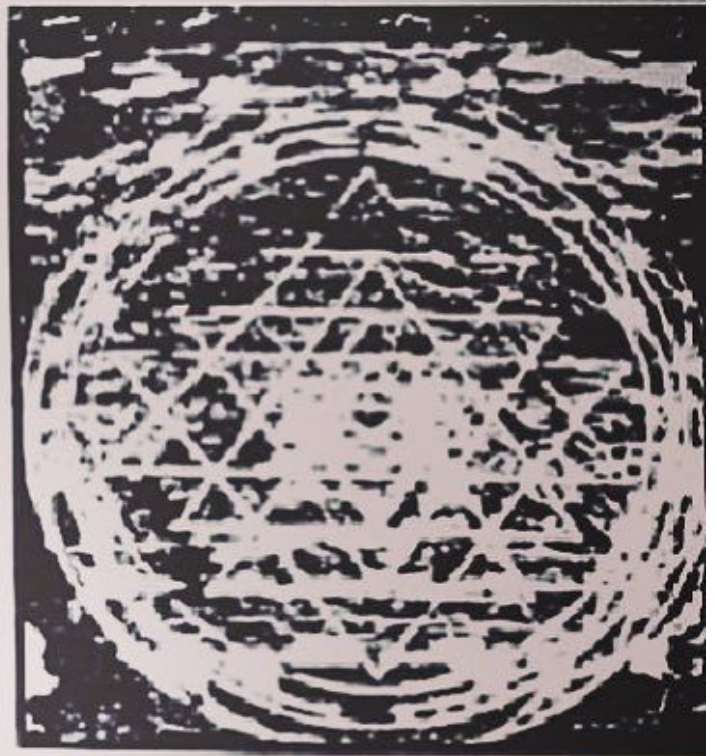
OM sound on a Tonoscope