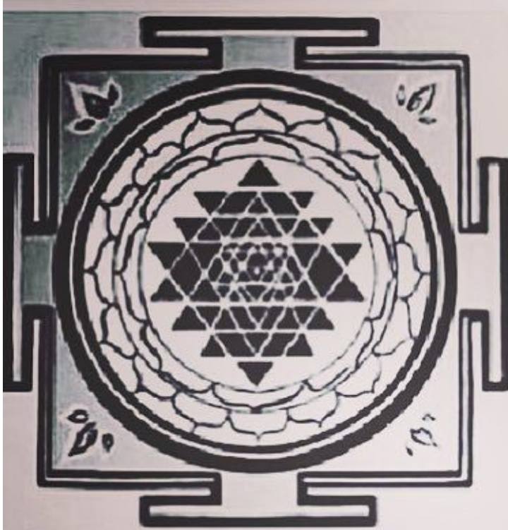
Sri Yantra (OM) Mandala