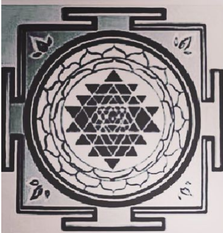
Sri Yantra (OM) Mandala