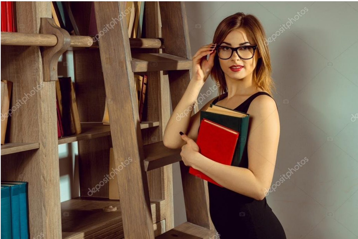
(BTW we tend to dress informally in the library nowadays, though we always have a lanyard. Somewhere.)