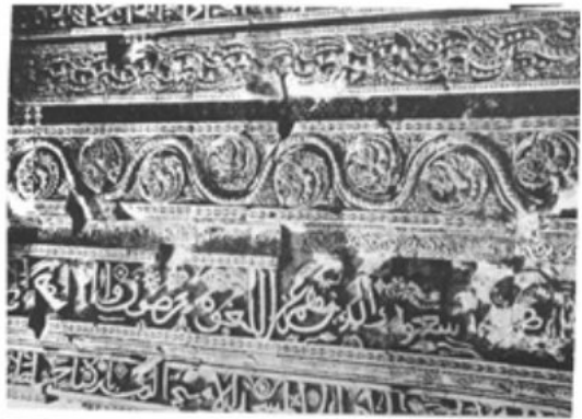
43. A panel of the so-called Kutub tower in Delhi. The exquisite serpentine Hindu pattern in the upper part is the wreath called 'Makar Torana' because it emanates from the mouth of a crocodile. This is a very common sacred Hindu motif in historic buildings. The Islamic tampering and forgery in stone may be seen in the lower portion. An attempt has been made to plant Koranic lettering. Such forgery in stone fooled even historians who thereby inadvertently ascribed these buildings to Muslim authorship.