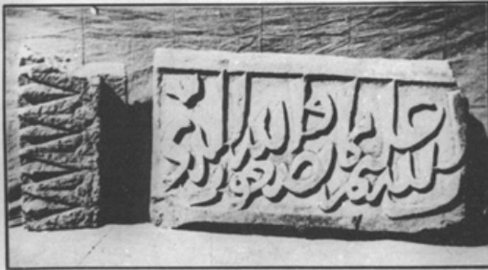
(b) REVERSE OF (a), SHOWING THE NASKH LETTERING.