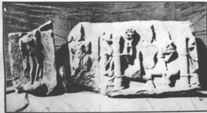
(a) OBVERSE OF HINDU SCULPTURED STONES, THE REVERSE OF WHICH IS INSCRIBED WITH NASKH LETTERING (ISLAMIC).