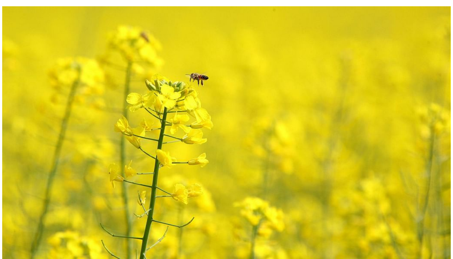
The spring season begins on the 5th day of the Magha month. Thus, #vasantpanchami is described as highly significant by Sages in our scriptures.