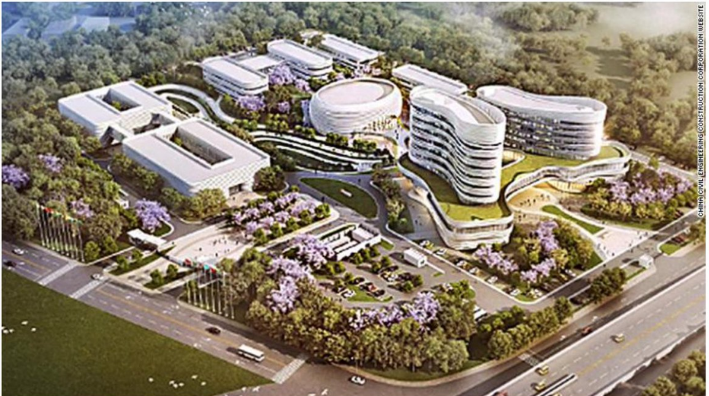
A rendering of the African CDC headquarters in Addis Ababa.

China is building the $80 million headquarters of Africa CDC