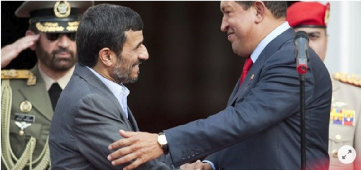
Good friends who scare the rest of the world: Iranian President Mahmoud Ahmadinejad and Venezuelan President Hugo Chavez