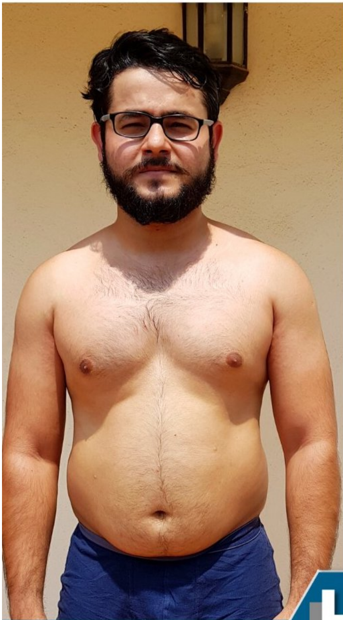
Before - 78 Kgs