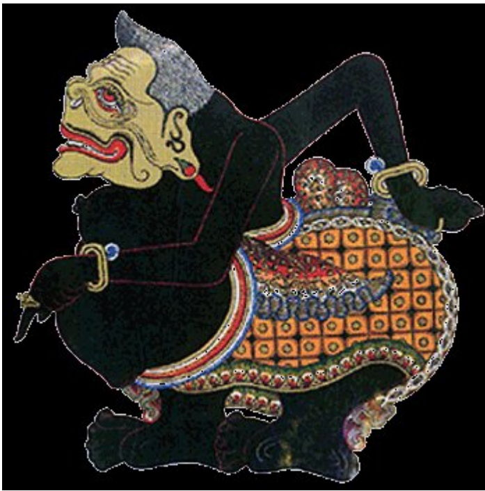
A similar clown in Malay wayang is Pak Dogol. Some treat him as the same Semar character, but he's usually said to either have been created by Sang Hyang Tunggal, or that he is an emanation of Sang Hyang Tunggal himself