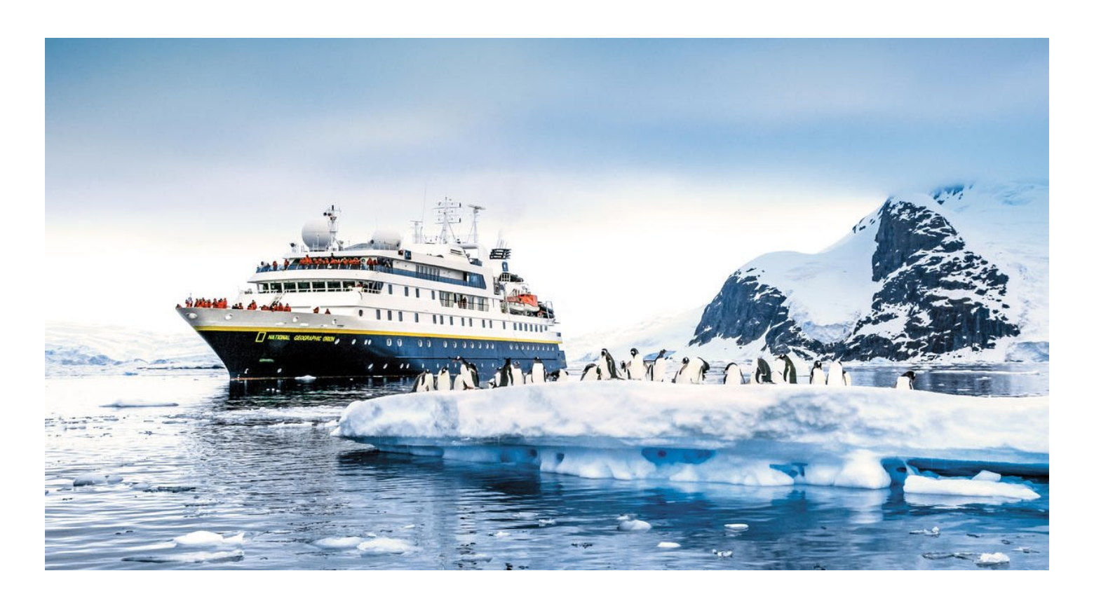
There are 16 restricted areas in Antarctica, and these restrictions are enforced by the Antarctic Treaty. This treaty includes 12 countries. I find it odd that our world's leaders cannot agree on anything, but they can agree on this?