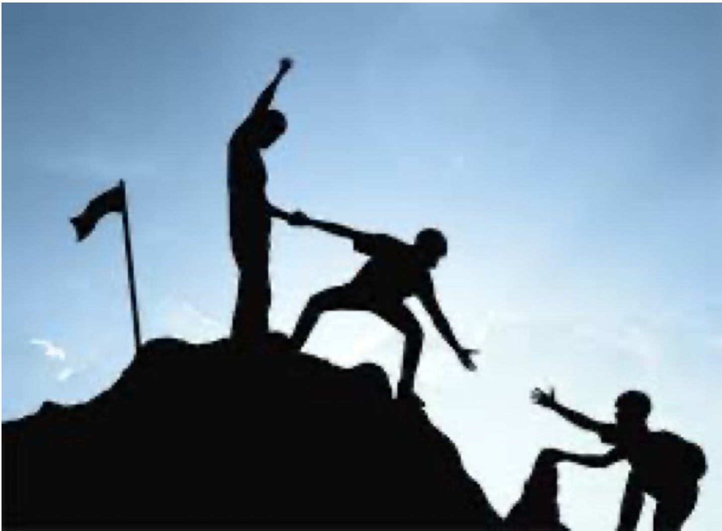
The higher we are placed, the more humbly we should walk. #BeHumbleLikeSSR #JusticeForSushantSinghRajput