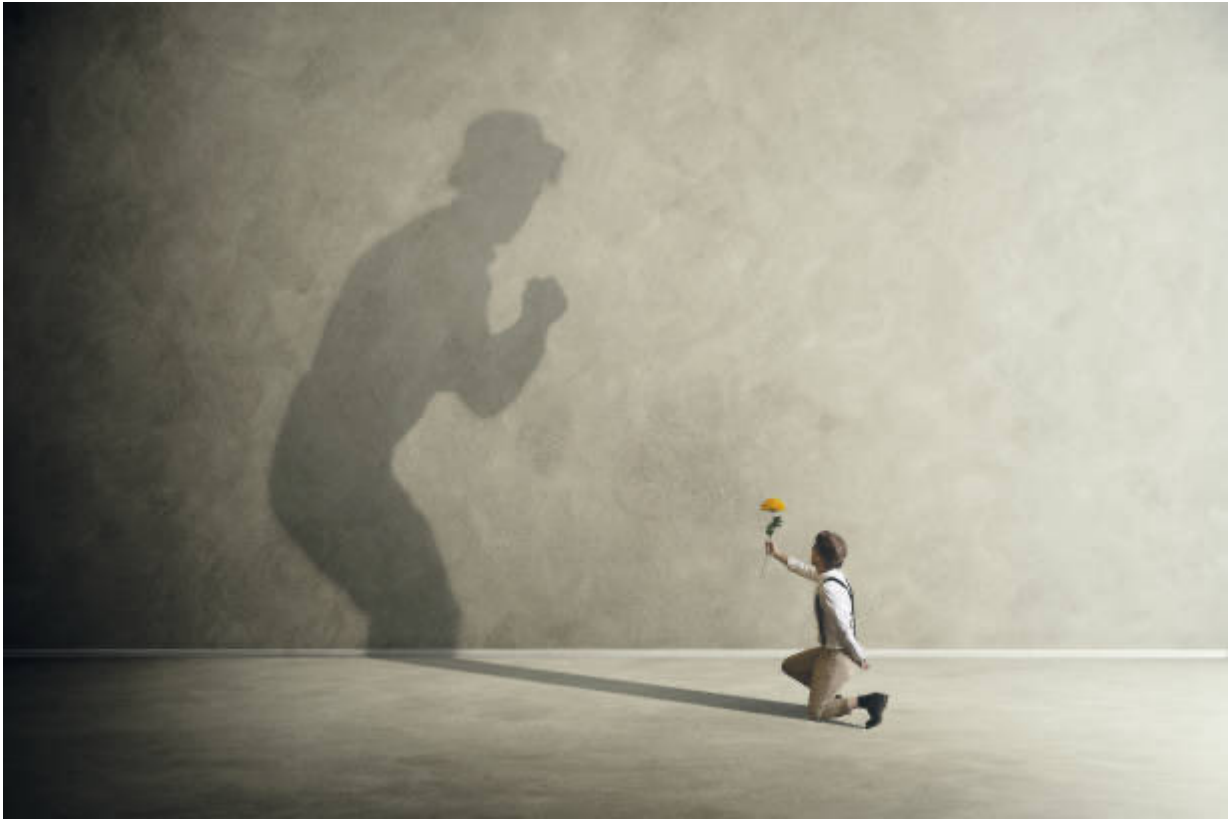
I am ... humble enough to know I'm not better than anyone else, but wise enough to know I am different. #BeHumbleLikeSSR #JusticeForSushantSinghRajput