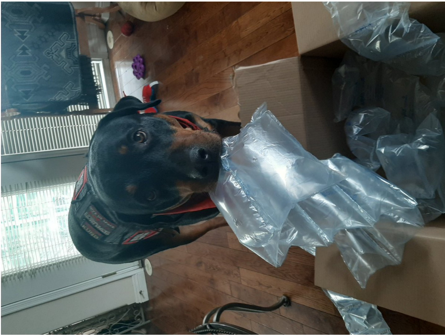
8. I would make a stunning statue!