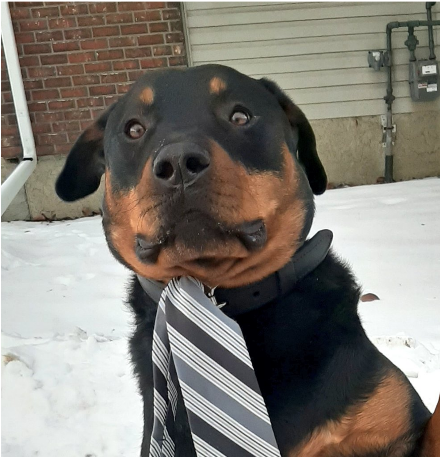
5. Training humans is Exhausting! Worth it, but exhausting.