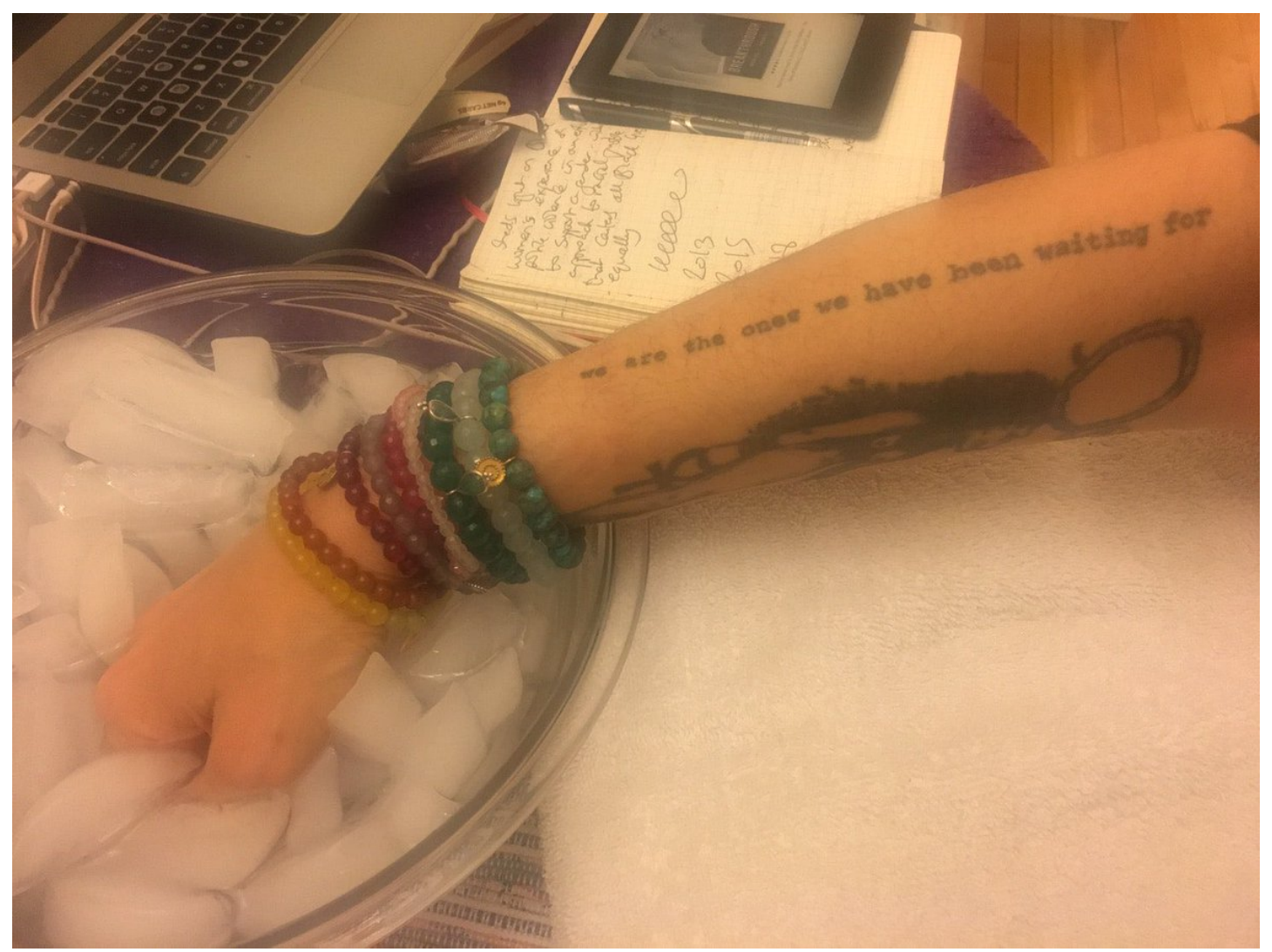
After I explained to a club manager what had happened, he ooked at my Beloved and asked me "Why didn't you let your husband take care of it?" I almost beat him up too.

Three years ago today, I was icing my knuckles because I'd beaten the fuck out of a man who had groped me in a club a couple of nights before. I wrote about it in my new essay <a href="https://t.co/SqzluTtJKb">https://t.co/SqzluTtJKb</a> ■ @rerutled #IBeatMyAssaulter