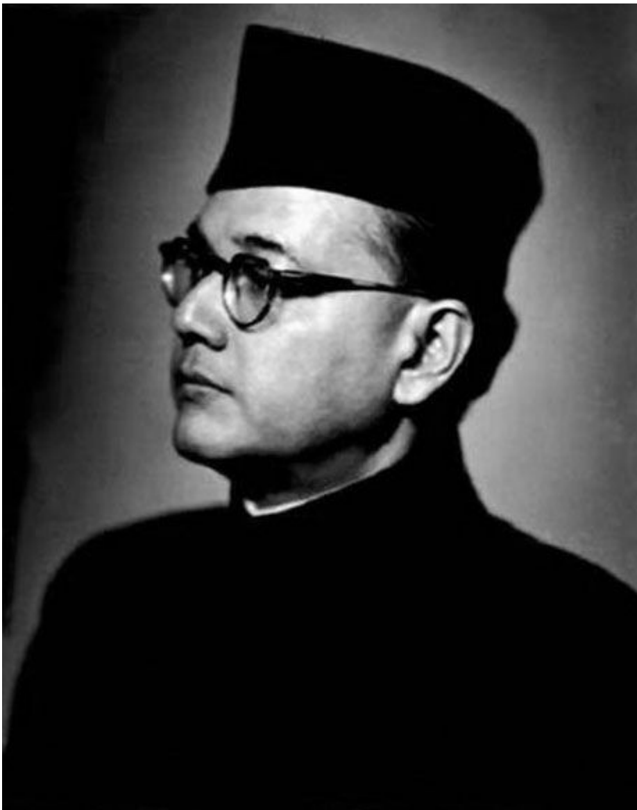
Raised in Germany, this force never found its place in the hall of fame like the Indian National Army (INA). The Indian legion became tainted due to its association with the German army. Soon the legion was cornered by allies and French resistance.(1)