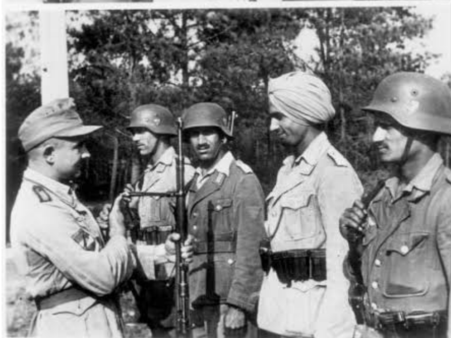
Bundesarchiv, Bild 183-J16605 Foto: Werner | Februar 1944