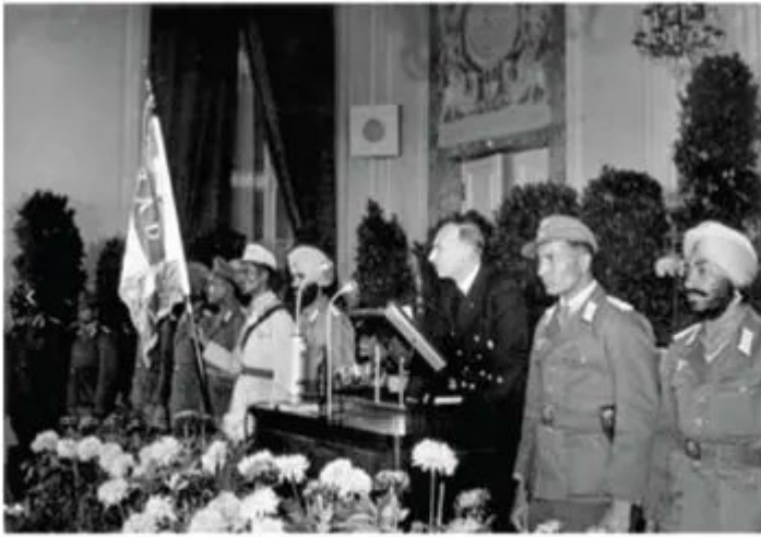
A ceremony marking the establishment of the Provisional Government of Free India held by the Free India Centre in Berlin, 1942 with soldiers of the Indian Legion and German and Indian dignitaries present.

Mass trainings were held in which Indian POWs joined in allegiance to Germany and netaji. The Indian legion was formally attached to the Wehrmacht, Germany's professional armed forces. The commanding officers were German.(6)