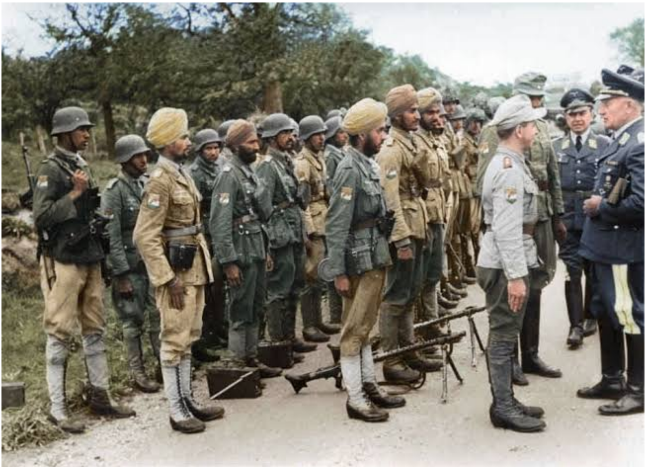
Thus, the Indian legion, Netaji's firstborn army, orphaned by war and politics finally passed into oblivion.(15)