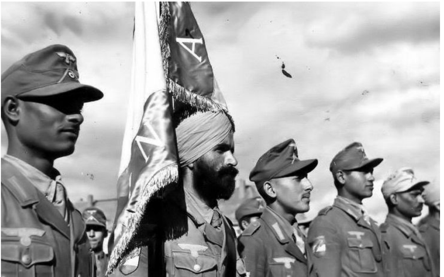
Allied forces intercepted them where some Indian soldiers were summarily executed. The remaining were handed over to the British army who mistreated them for defection. The humiliated men were shipped back to India and some stood at the INA trials on charges of treason.(11)