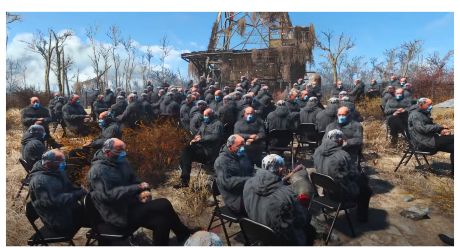
The recent Bernie-mittens meme was a sterling example of this, tickling me right to my core, and I just happened on an especially delightful apex example of the form: <a href="mailto:@ToastedShoes's">@ToastedShoes's</a> video of Sanders incorporated into eight AAA video-games.