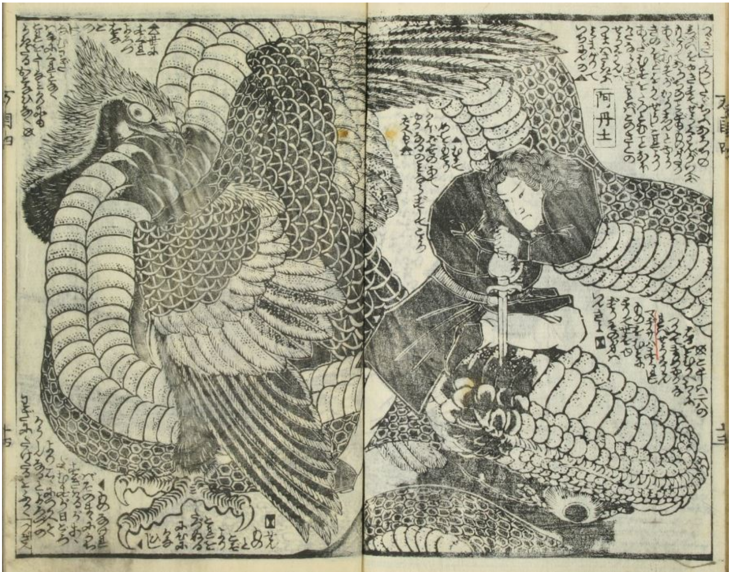
This 1861 book was by author Kanagaki Robun (■■■■■) and artist Utagawa Yoshitora (■■■■■).

The title is "Osanaetoki Bankokubanashi" (■■■■■■■) and it was based on 2 other second-hand sources, "Kaikoku Zushi" (■■■■■) and "Amerika Itt■shi" (■■■■■■■■■). 15/