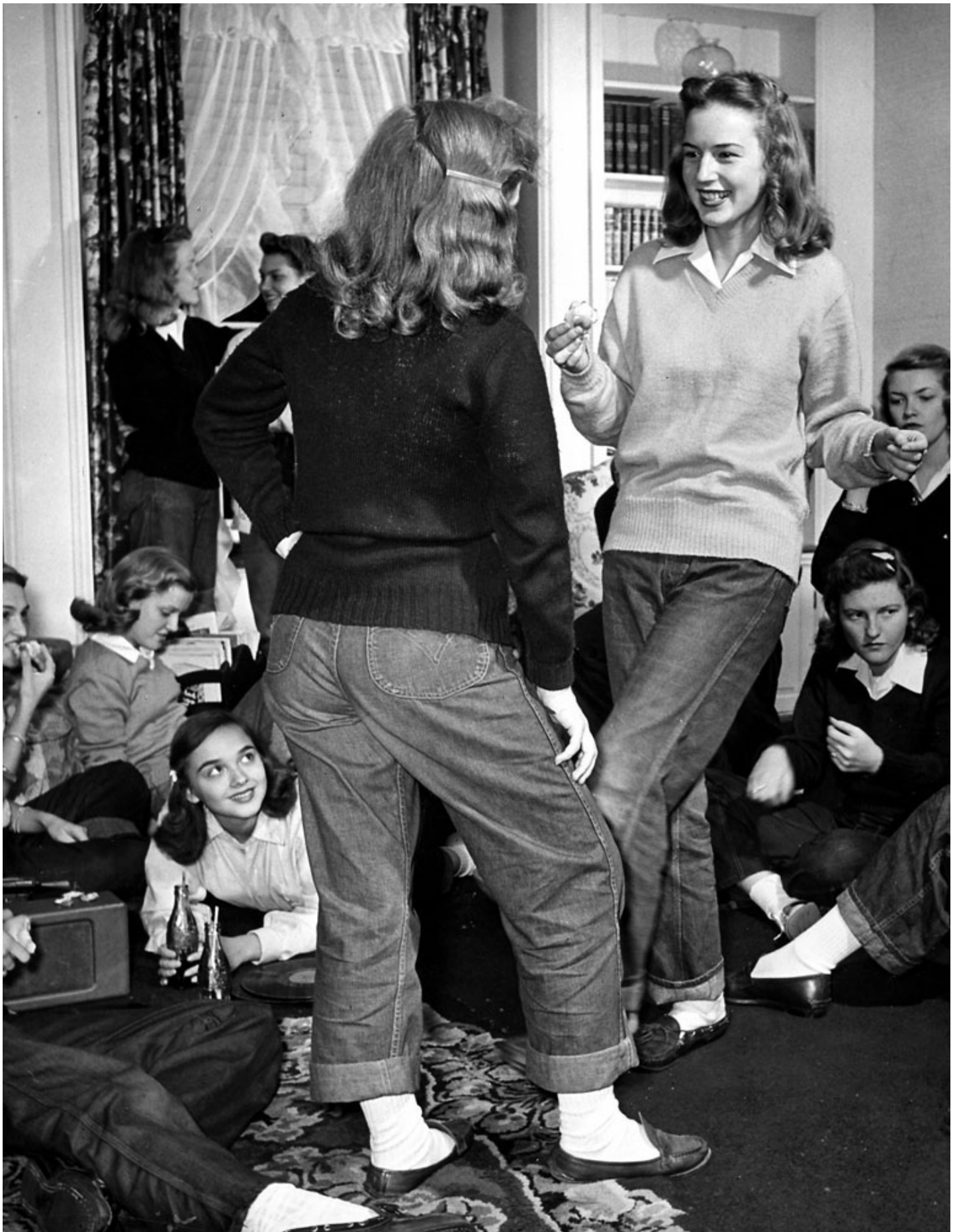
The moral panic over Rock 'n' Roll in the 1950s wasn't just about hot rods and rumbles - it also swept up the disquiet about independent teen girls that had been building since the Bobby Soxers.