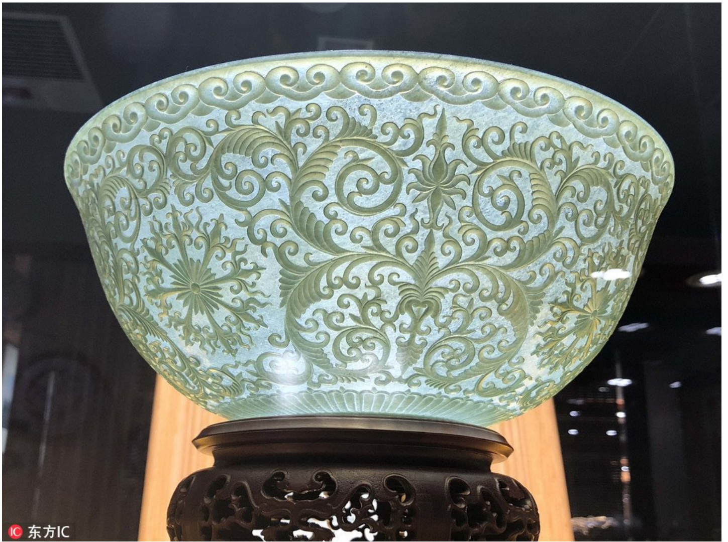
Intricately carved Mayan bowl, classical period (AD 250-600). ■National Museum of the American Indian