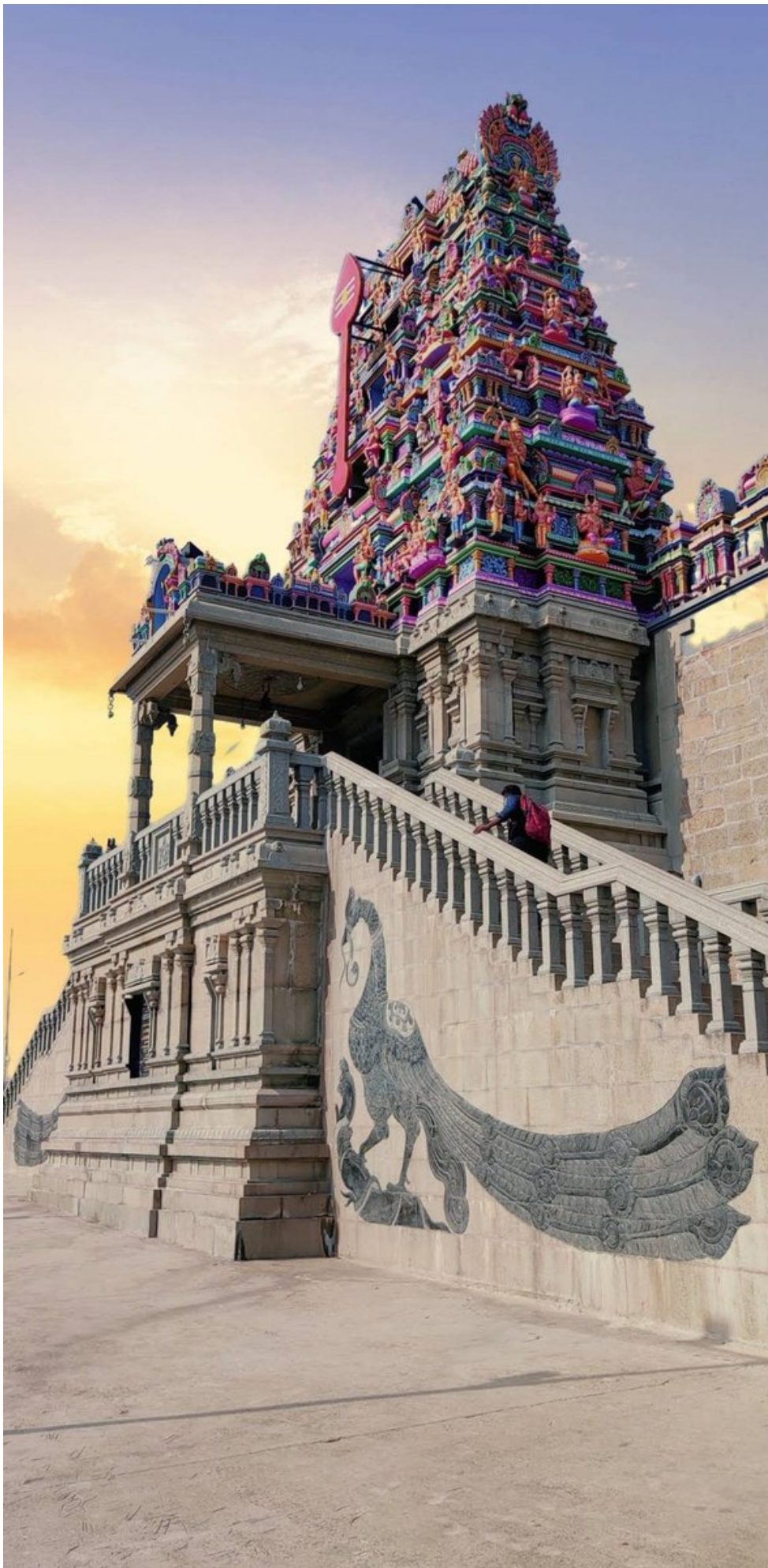
Devi is worshipped in the temple as Thirumalai Kaali amman